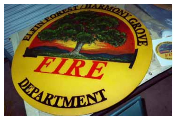
Our department's new building sign.