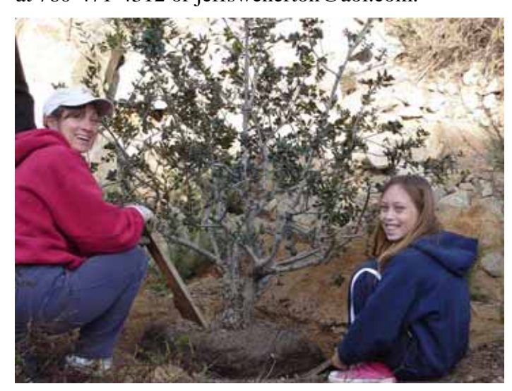
Tree planting at the EFRR on January 28, 2006.

The invitation for volunteers is just for the surrounding communities making this a much smaller event than the previous tree planting. Water and snacks will be provided. Adventure 16 outfitters will provide giveaways to all participants. Volunteers should wear long pants and long sleeve shirts. If you are interested in volunteering, contact Jeff Swenerton at 760-471-4312 or jeffswenerton@aol.com.